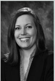
Minority Leader – Senator Katie Hobbs

The minority whip's (and co-whip's) job is to gather the necessary votes on a bill for that party.