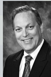
Senate President – Senator Andy Biggs

The speaker is in charge of the House and represents the House with the governor and the Senate president.