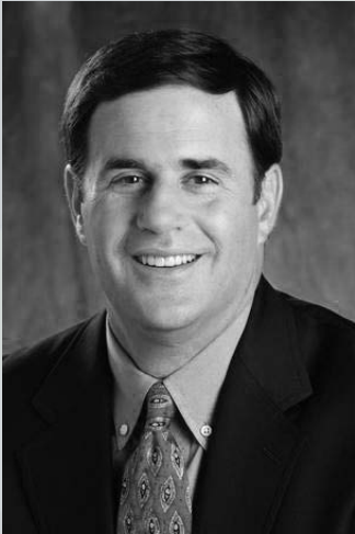
Governor of Arizona – Doug Ducey

2015 has brought a number of changes to the Capitol. We have a new governor leading Arizona along with three sets of new caucus leaders in the Legislature. Below is a brief overview of the new executive and legislative leadership.